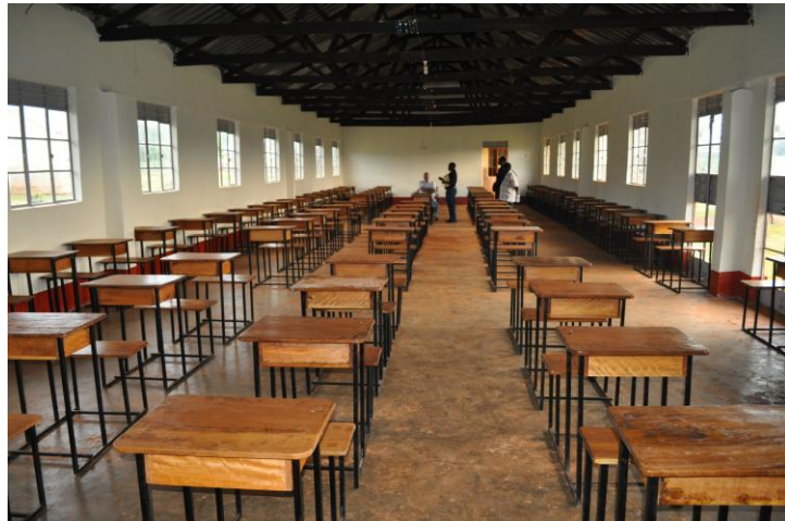
New desks IOCC purchased for the school